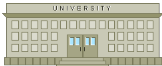
123 Main Street, New York, NY 10044, Building 1