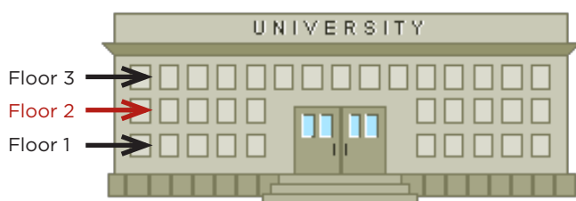
123 Main Street, New York, NY 10044, Building 1, Floor 2