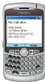
Email Crisis Alert on BlackBerry

Both the EGW and the ERS can deliver email alerts to designated distribution lists based on a 911 caller's ERL. Email alerts include the caller's name, callback number, and location information, and can be directed to alpha-numeric pagers, smartphones, or SMS gateways.